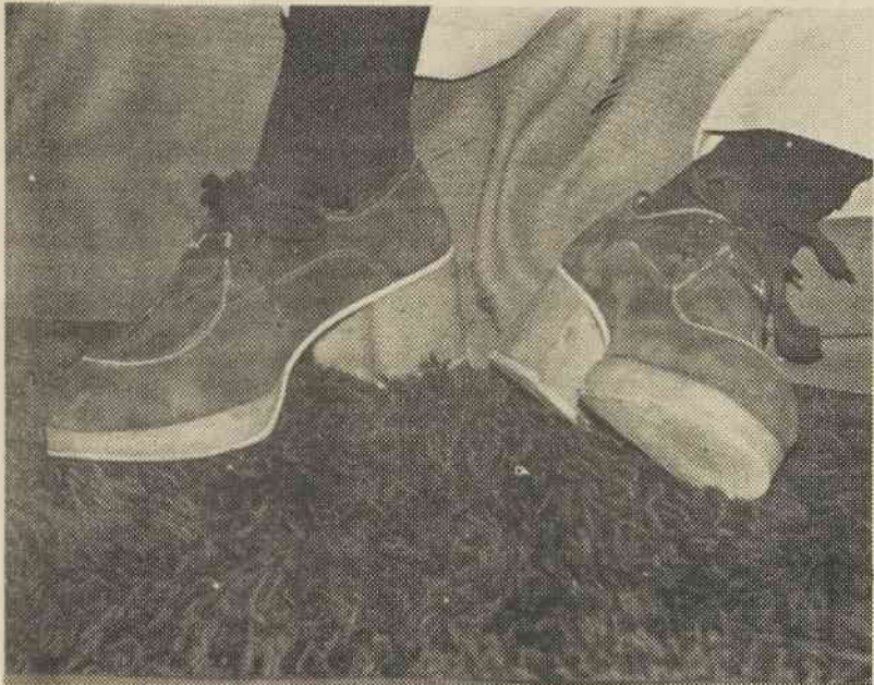
Traditional cowhide converted to suede . . .