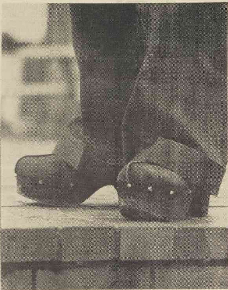
Ridges and rivets join the jubilee