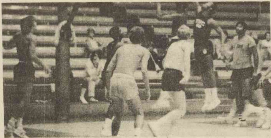
The basketball players are in Carmichael daily, honing their skills for the upcoming season.