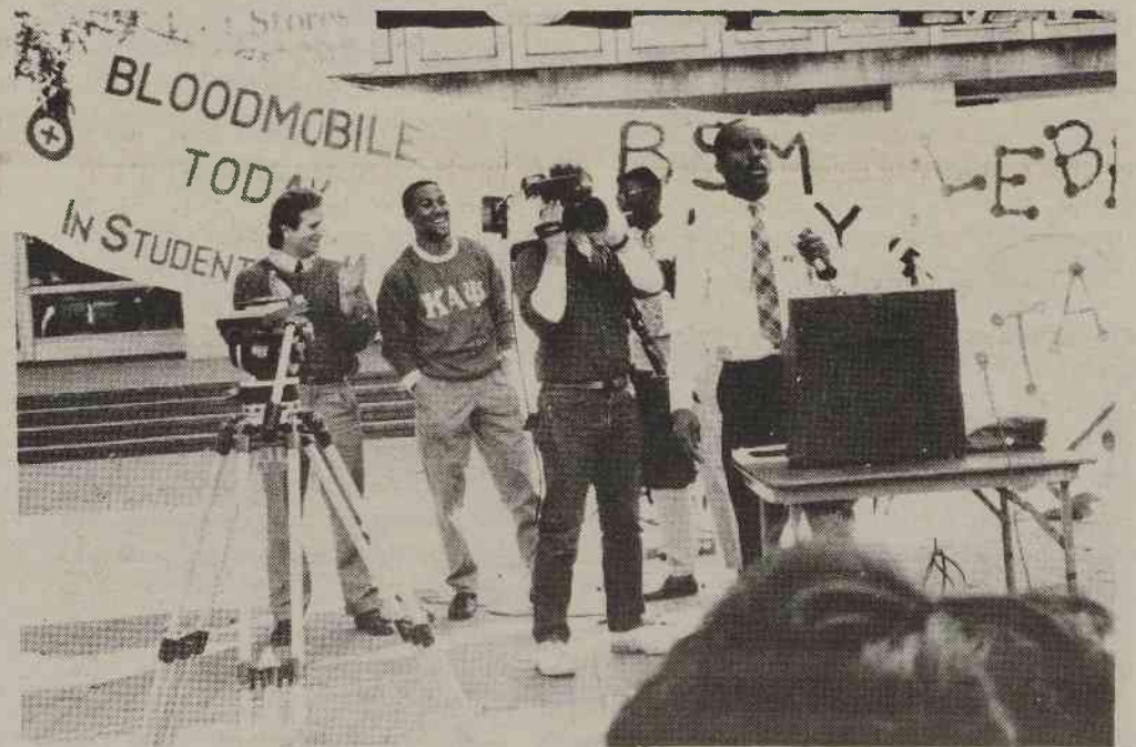
BSM Rally Speaker.