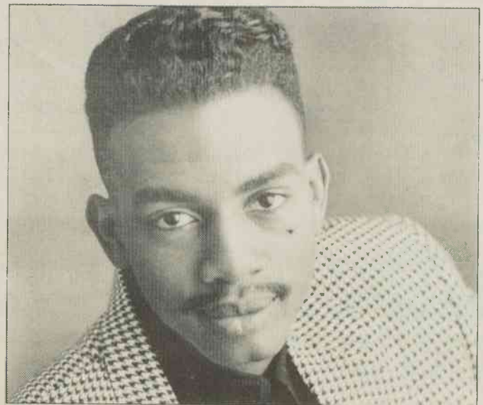
Comedian Bill Bellamy made an appearance at "Steppin Back to Africa," a stepshow at Duke U.

Look for the sure-to-be hype solo album by Snoop Doggy Dog entitled Doggy Style . A-