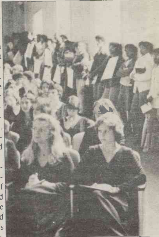
Look familiar? Blacks qu Unive