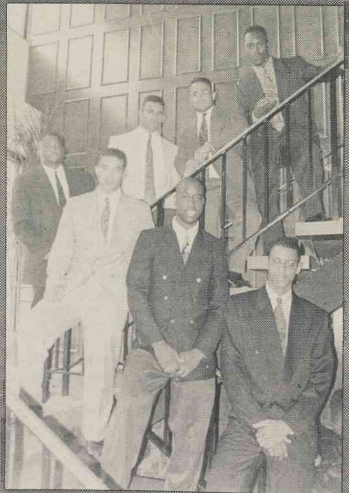
A series on the Black Greek letter organizations. Above, members of Kappa Alpha Psi Fraternity, Inc. never pass on a photo opportunity.