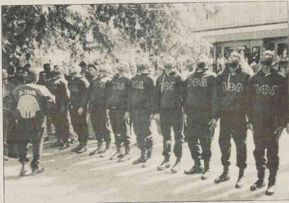
The Mu Zeta chapter of Alpha Phi Alpha bring out their newest initiates.

The THETA OMICRON Chapter of KAPPA ALPHA PSI the University of North Carolina Presents :