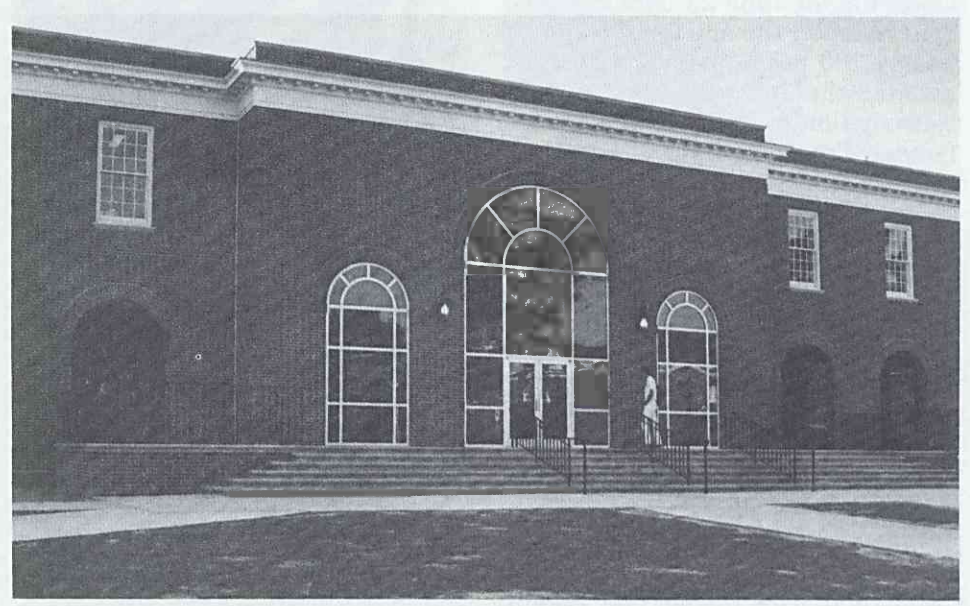
The new entrance of Randall Library faces the Social and Behavioral Science building. The library gained 23,500 square feet, has seating space for 950 students, and can accommodate 475,000 books.

The library also houses a large lounge near the entrance, furnished with comfortable chairs and sofas for studying or relaxing.