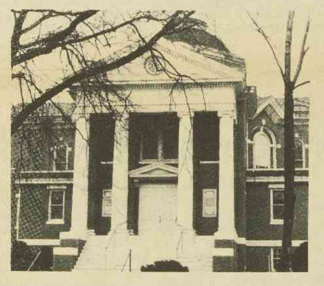
Site-Lincoln County Campus