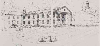
SCHOOL OF BUSINESS BUILDING