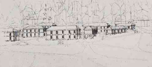
RESIDENCE HALL COMPLEX

A concert for the spring semester is being planned.