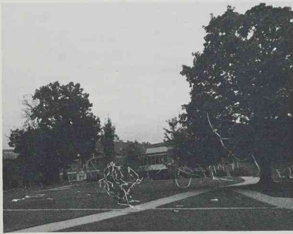
HOMEcomings ROLLERS HANDIWORK

The new President will be visiting the campus several times before he fulfills his duty as President. These visits will give us the opportunity to welcome him to his new home.