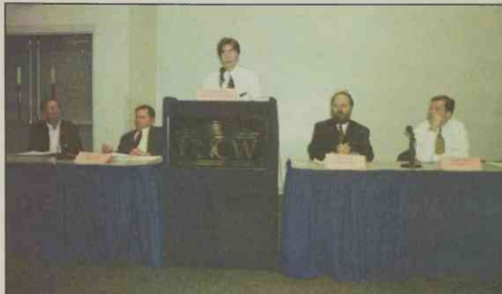
Representatives from local political parties spoke in support of their candidates at a forum on Wednesday night sponsored by SGA and the leadership center.

The North Carolina Higher Education Bond Referendum was an important issue discussed at the debate. If passed, the bond will distribute $3.1 billion to public universities and community colleges in North Carolina. Other issues discussed included school vouchers, the second amendment, the war on drugs, public education, healthcare, taxes and social security.