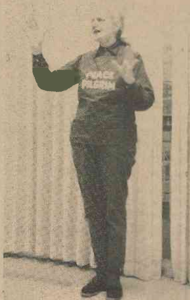
This is a challenge to St. Andrews Peace Corps.

Mankind, she declares, is drifting toward war and destruction out of pure apathy and only meaningful action by the concerned backed by inner understanding and harmony can ameliorate man's immaturity. This harmony must be introduced on the interpersonal, community, and international levels.