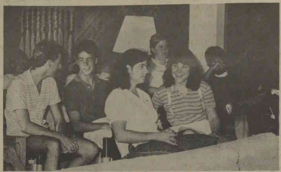
Students gather for fellowship.