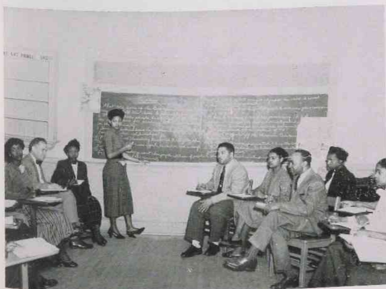
JUNIOR ORGANIZATION FOR TB CONTROL