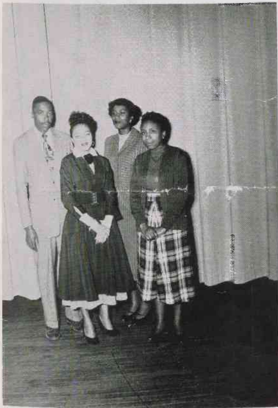
COMMITTEE ON ORGANIZATION