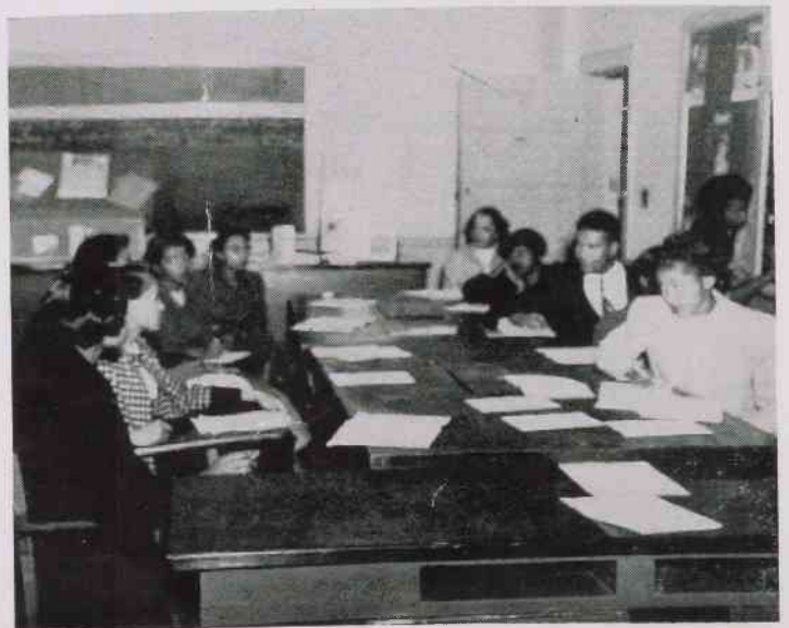
THE HELPING HAND GROUP