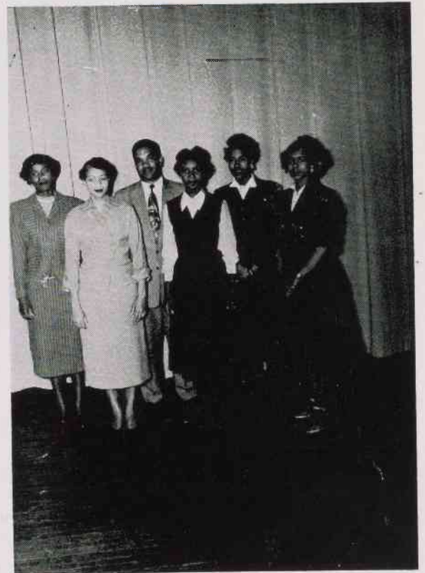
COMMITTEE ON RECREATION