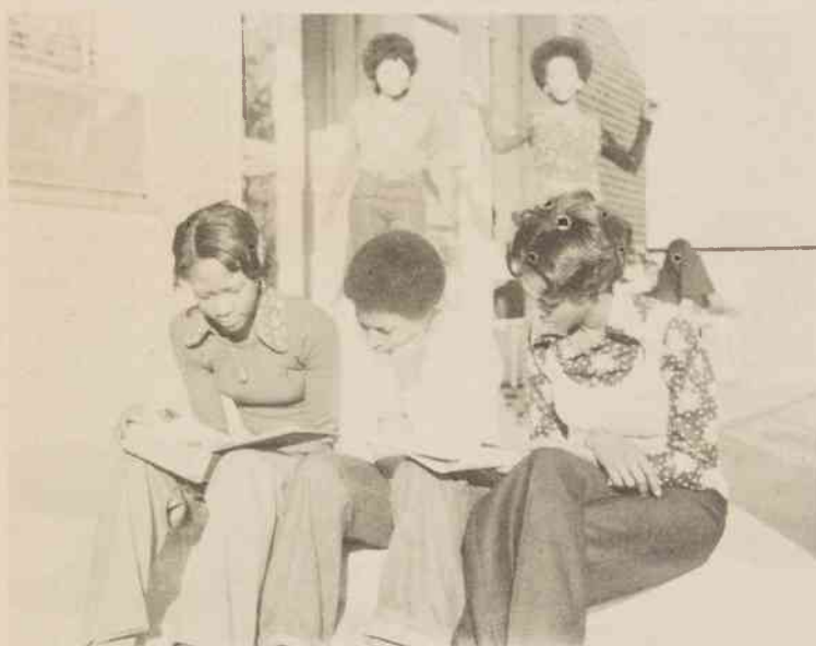
The warm October weather brought "mid-term booking" to the steps of Moore Hall.