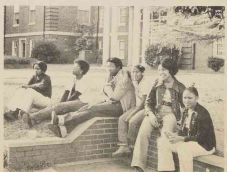
"You know I feel like you feel..."