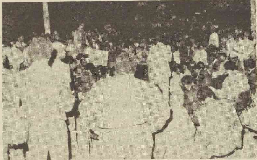
Thousands of students at predominantly black colleges and universities flocked to Raleigh for a statewide march and rally in support of Black College Day.

The march and rally was part of a national day of observance for predominantly black colleges. The festivities at WSSU served as a local Black College Day celebration. Black students throughout the state traveled to the state capital in Raleigh where they were joined by state and national black leaders.