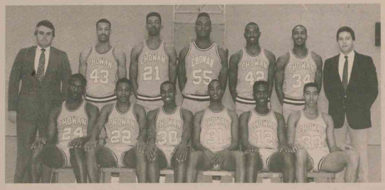
Chowan Braves — 1989-90

With the season winding down, Chowan defeated two Region and Conference opponents, Spartanburg Methodist and An-