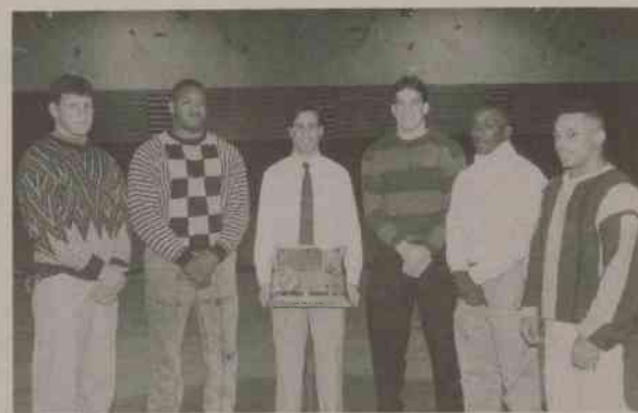
Chowan Braves Wrestling Program, Mid-Atlantic District Champions, 17-0-2, Fifth in the nation

With two programs participating in national tournaments, wrestling finishing 5th in the nation, and volleyball 11th, 58 wins in basketball and volleyball, and 14 All-Americans, 1989-90 was another successful year for the Braves. This year should be even better for Chowan College.