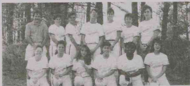
The Lady Braves

The Braves, who finished their season with a 3-18 overall mark, lose only three players from the squad.