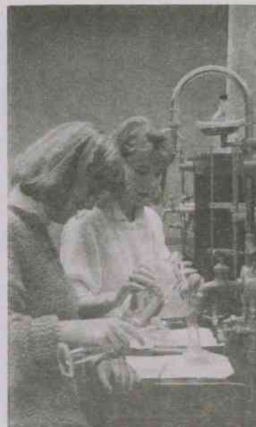
It's fun to visit Chowan!