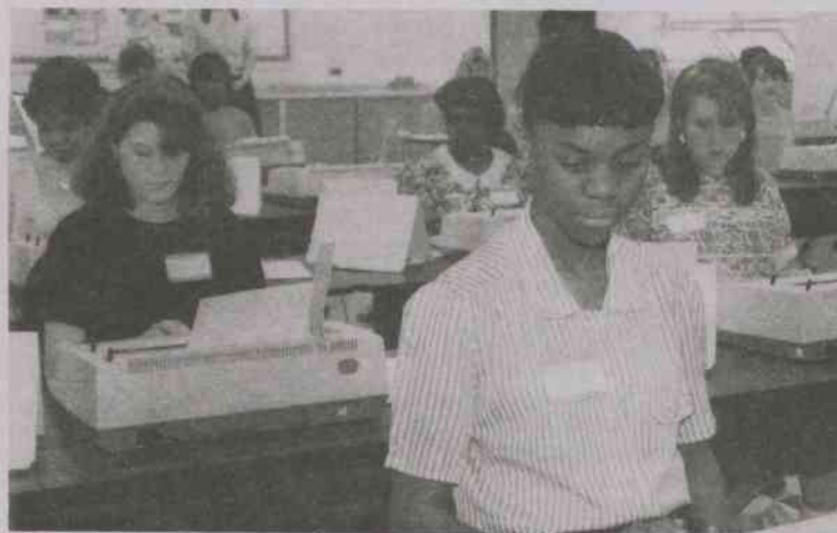
And they're off! High school students compete in the annual typewriting contest.