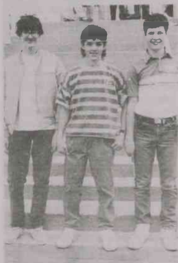
Three young mathematician whiz kids who came to Chowan to test their skills.