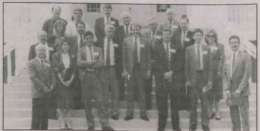
Twenty leading commercial printing industrialists from N.C. and Virginia came to Chowan May 20 for the initial meeting of the Krueger Forum a newly formed group to assist with resource development, enrollment and curriculum for the William A. Krueger School of Graphic Communications.