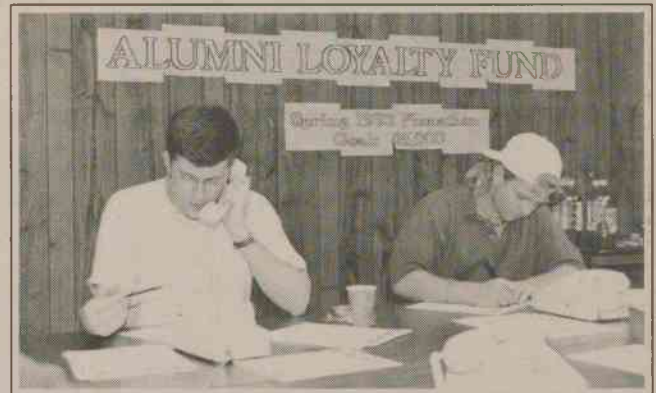
By Eric A. Surface

Clary expects the callers to excel the $5,000 goal set for the mini-phonathon.