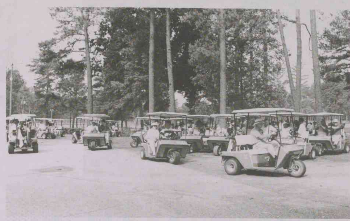
More than 80 golfers await in their carts for the starting signal to begin the '93 contest.

Student athletes also performed well in the classroom, as 21 individuals were named to the spring semester Dean's List for their academic achievements.