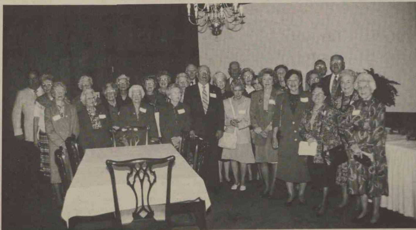
The Chowanian Society posed for a group photograph in the President's Dining Room after a period of fellowship to renew acquaintances prior to the annual alumni luncheon. Members of the society attended Chowan more than 40 years ago, and each member enjoyed telling of the "old days" at their alma mater during their reunion during Homecoming weekend.