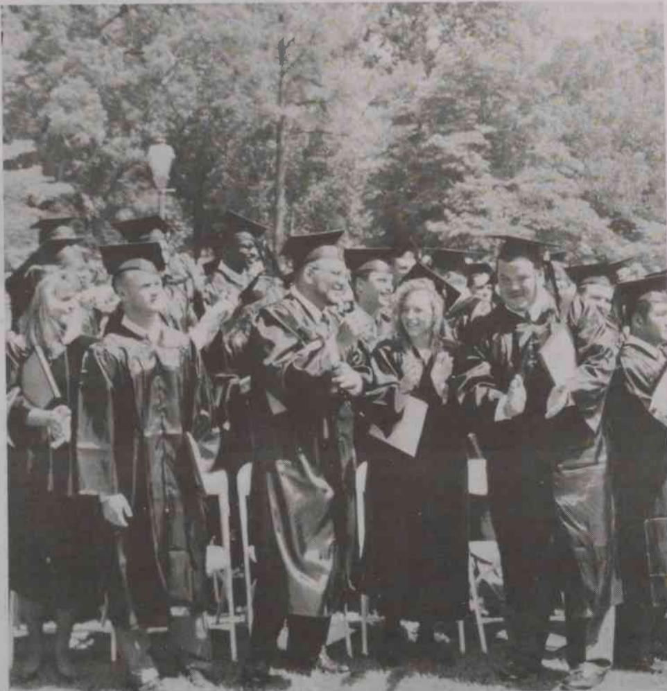
Graduates in the Class of 1996 are jubilant after receiving their degrees and hearing the proclamation from the president of the college that they are now Chowan alumni!