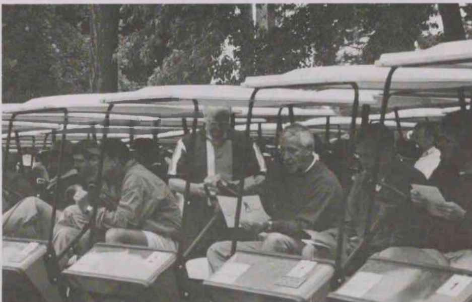
Awaiting final instructions for the sixth annual Chowan Classic, eighty golfers competed for trophies and prizes in the popular spring event sponsored by the Alumni Association.