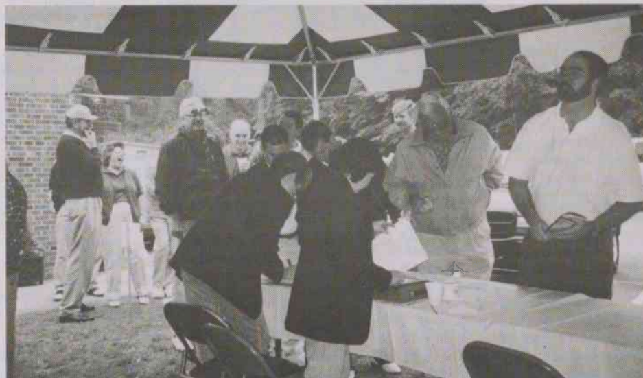
Golfers arrived early on the chilly morning to complete registration procedures and enjoy fellowship before the tournament.

Other hole sponsors included Centura Bank, Snake Eyes Golf Clubs, Ponte Vedra Beach, Fl., Golden Peanut Company and R. L. Stephenson Realty, Smithfield, Va.