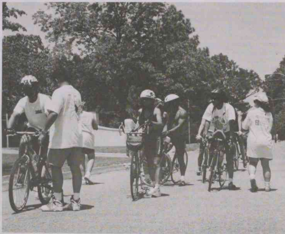
More than 450 cyclists peddled onto the campus during their tour to raise funds for the Multiple Sclerosis Society.

Information may be obtained for next year's ride by calling the MS Hampton Roads Chapter office at (757) 490-9627.