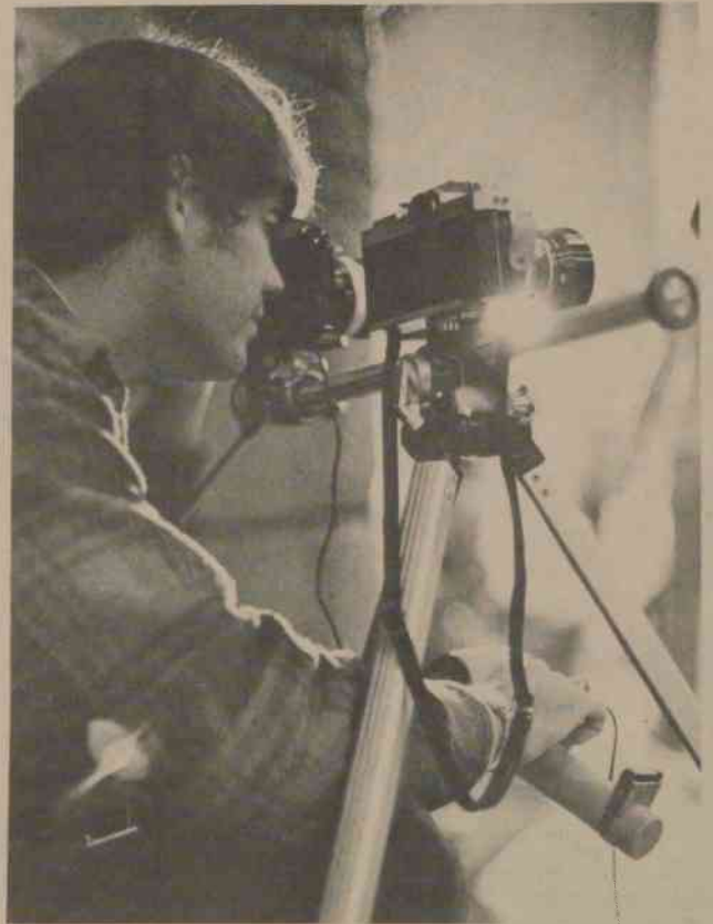
CHOWAN'S STUDENT photographers work with the latest camera and darkroom equipment as provided by the School of Graphic Arts.

Dean Lowe stated that the new program is a natural expansion and out-growth of the existing programs in graphic arts and commercial art of the college in an attempt to meet a genuine need for such courses on the part of students and industry.