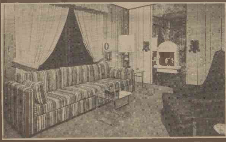
YOUNG MANHATTAN BY PEACHTREE HOUSING