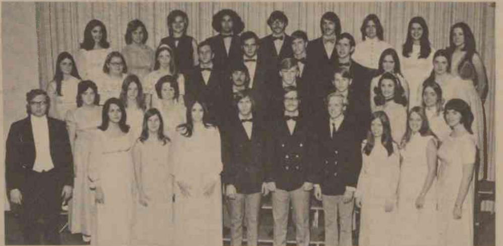
CHOWAN'S CONCERT Choir received enthusiastic responses from church and high school

remain active as artists, not only for their personal enjoyment but as part of the teaching process.