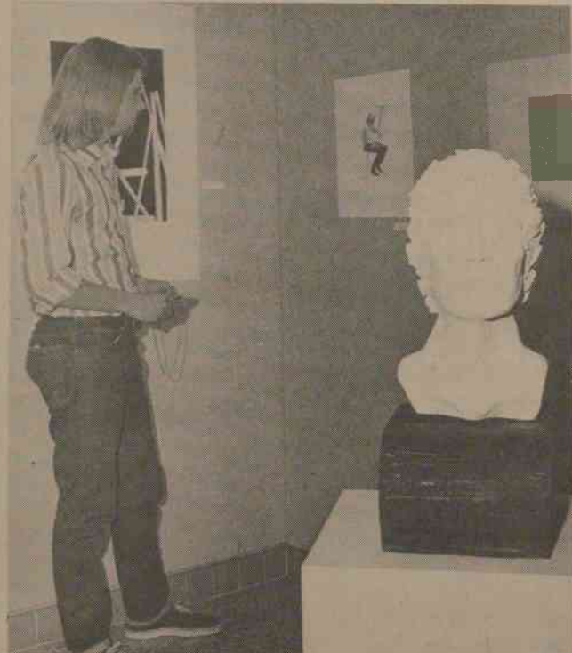
A STUDENT VIEWS a portrait of himself completed by an art student at Chowan. The other works in the picture were also made by Chowan students enrolled in the division of art within the department of fine arts.