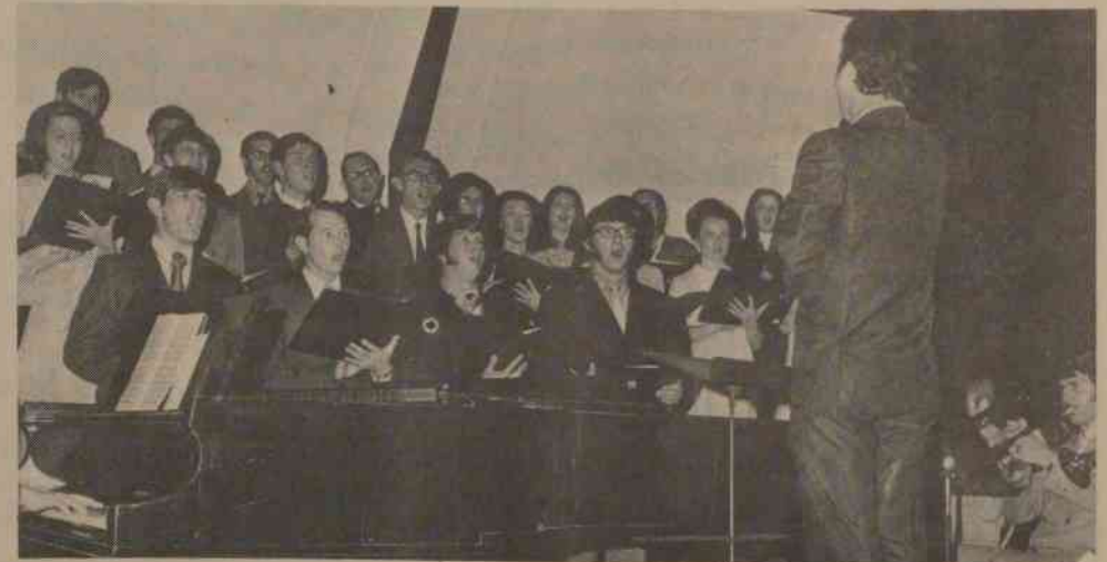
THE COMMUNITY Chorus and Orchestra attracts students and area residents who present concerts in the fall and spring. The director is