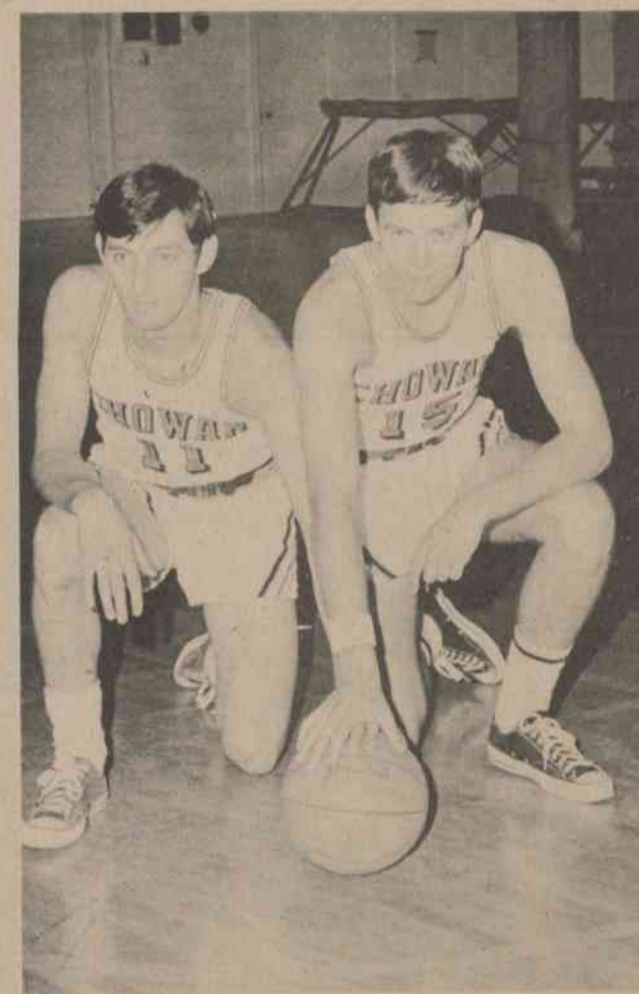
'Hoop-throwers' prepare for season

His speech was aimed at trying to awaken those students who weren't using their full potential and for those who were to push on.