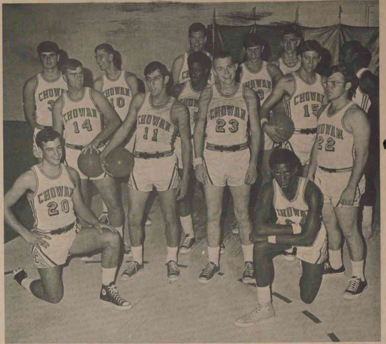
They'll be trying to put Chowan in the "hardwood" limelight