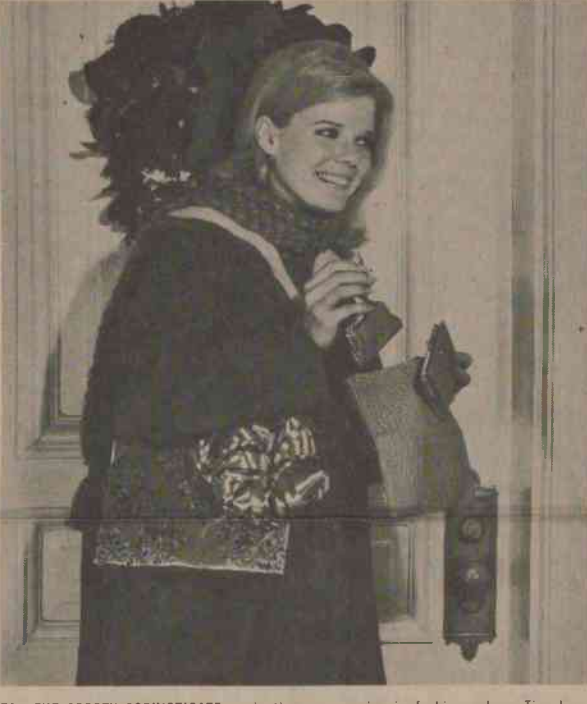
FOR THE SPORTY SOPHISTICATE — leather accessories in fashion colors. Tiny key-case/purse and slim French purse will snuggle neatly into the Grab Bag fold-over clutch. Matching cigarette and eyeglass cases complete the set. All in textured leather in warm brown, beige or orange . Safari accessories by Enger Kress

SKI-ENTHUSIAST? Here's a splendid gift for "him" this holiday season. Superbly designed "Floater" boots by Bates — it's the "St. Moritz" — a classic design, adding the side buckle for the latest in men's fashion news. They're water repellent and styled comfortably in an above-the-ankle length. To assure warm and dry feet for work or play — not to mention after-ski wear . . . boots boast soft pile lining of 100% Herculon olefin fiber.