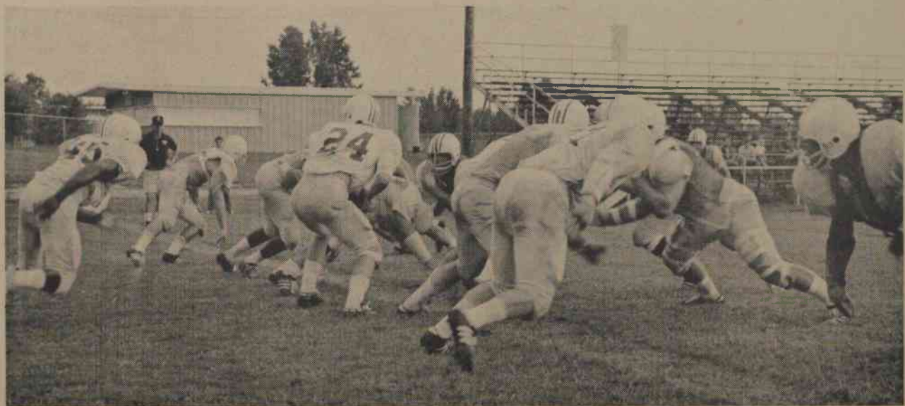
The Braves in action during recent scrimmage.