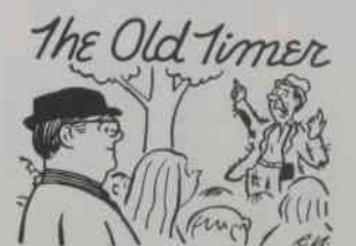
"A lot of fellows who spout so profusely about capital and labor never had any capital and never did any labor."