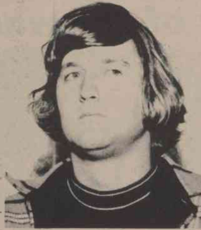
MILES T. GODWIN