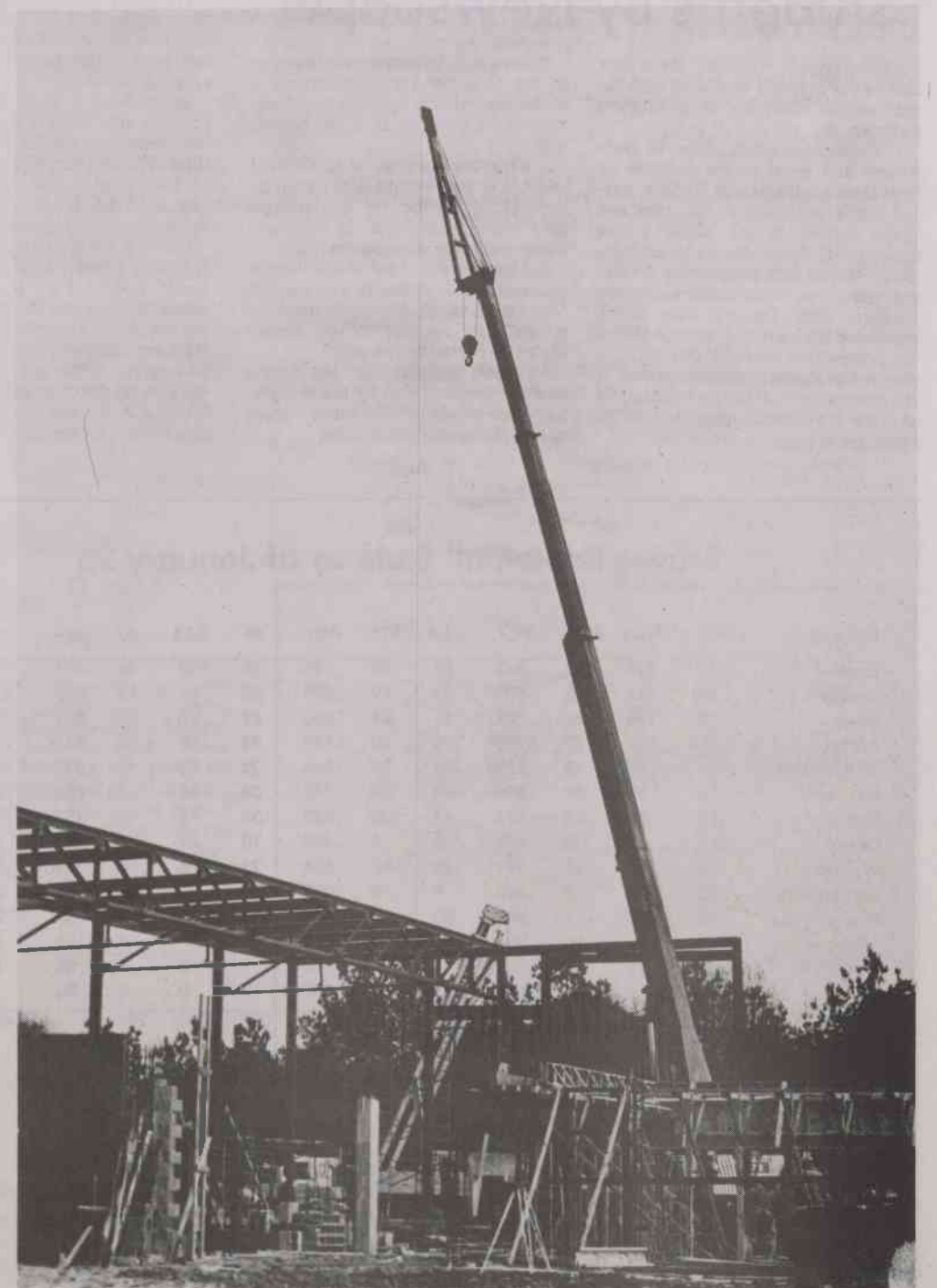
December 5, 1978