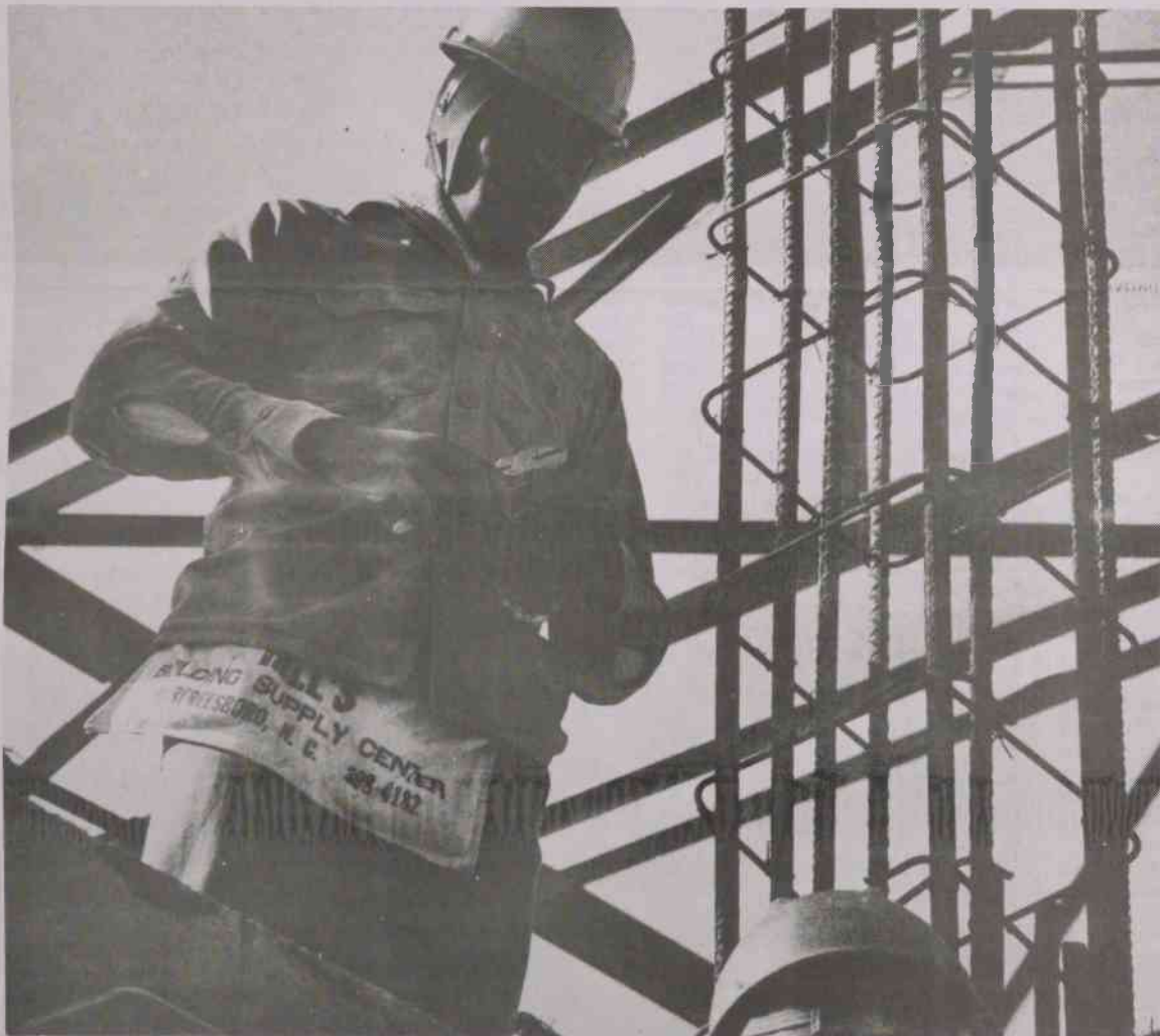
January 30, 1979