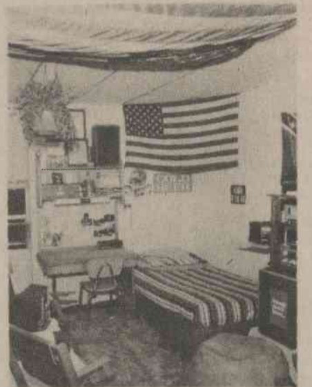
Patriotic motif repeated in West 331