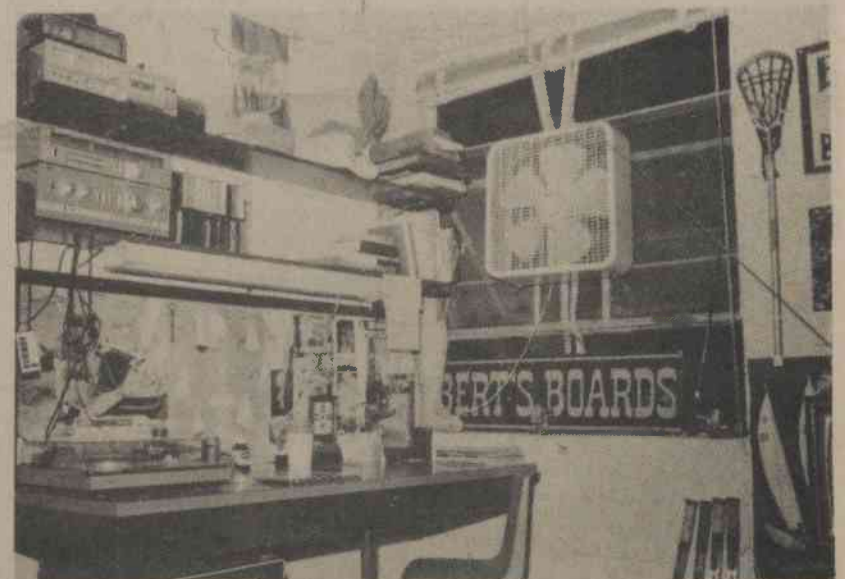
Another view of Gillespie's room.