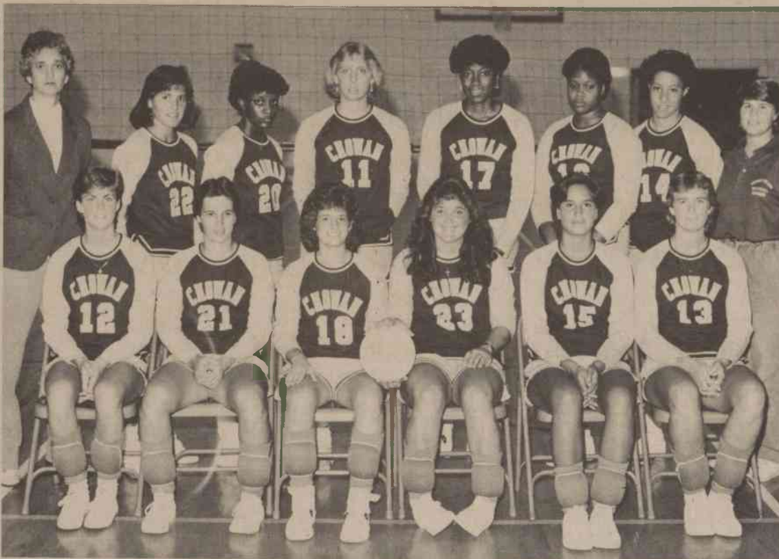
1985-86 Volleyball Team