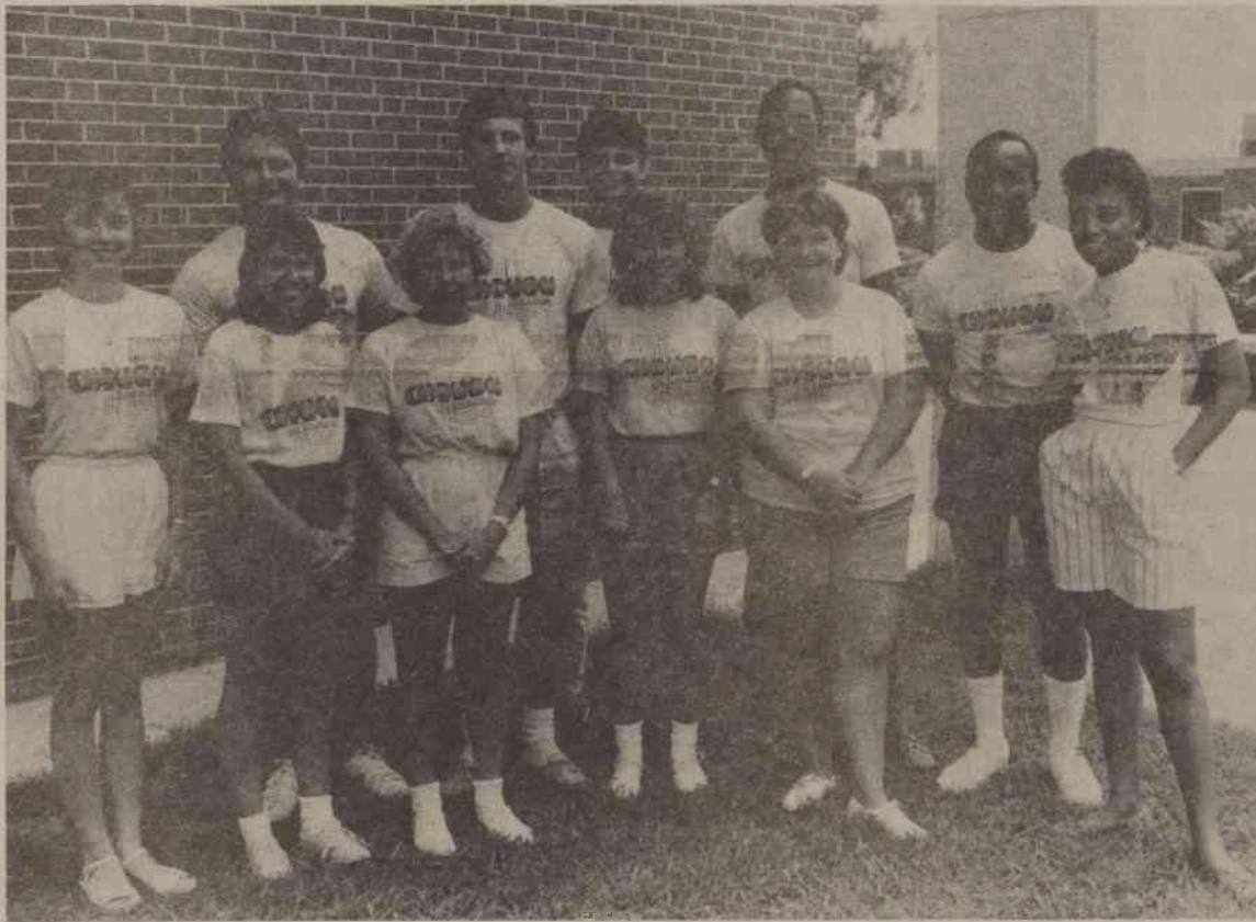
Summer Orientation Staff

If you are interested in working on this play, I am interested in meeting you. Drop by soon.