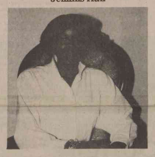
Lisa Mayo Jenkins Hall