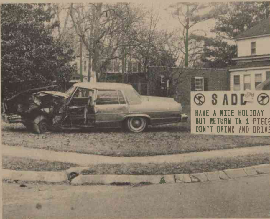
Providing an incentive to drive safely?