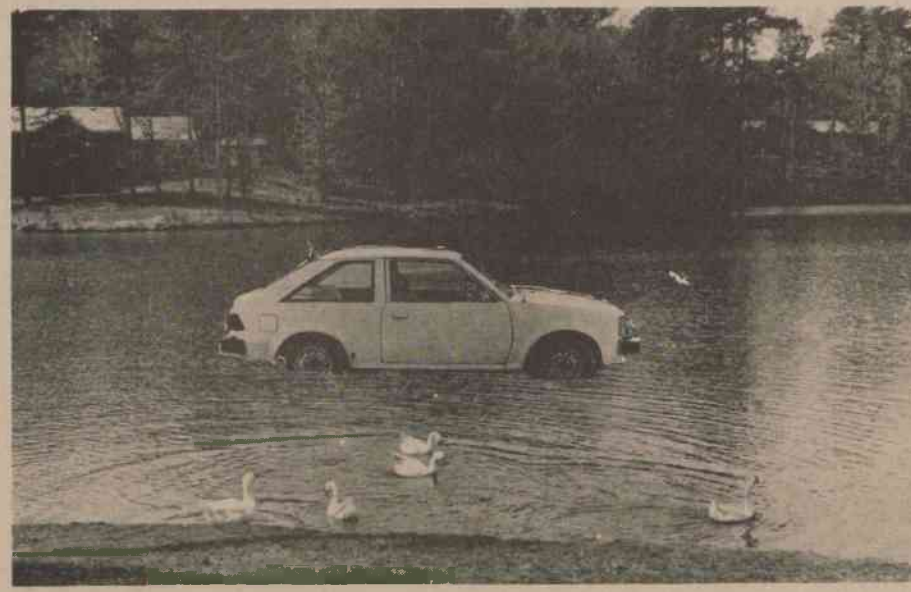
This is what happens when Security forgets to put on the parking brake. Last Friday afternoon one of the SMOKE SIGNALS photographers got this rare picture of SECURITY'S white escort drifting across Lake Vann. As you can see, the birds didn't really mind their new companion, but, unfortunately, the car was rescued soon afterward.

WHAT DO YOU WANT? ... a new tee shirt? ... a new cap to shade your eyes during Chowan baseball games? ... a tote bag to carry your books to the beach so you can study while sunning? ... a poster of Phylcia Rashad? ... Paul Newman? ... Dan Marino? ... a buffet dinner at Fred's Pizza? Then, take time to visit your library. Chowan students can always find what they need—from the ordinary to the exotic—in Whitaker library, but during National Library Week they can find what they want as well. Each year the American Library Association designates a week and theme to call attention to the nation's libraries. This year Chowan will again join in the celebration April 5-11. Chosen as the theme for this year is "Take Time to Read," and the staff of Whitaker Library invites you to take time to know your library and the many services it provides you, the Chowan student. While in the library, be sure to register for the prizes to be award each day, April 6-10, at 4:00 p.m.