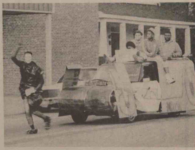
The Chase Scene