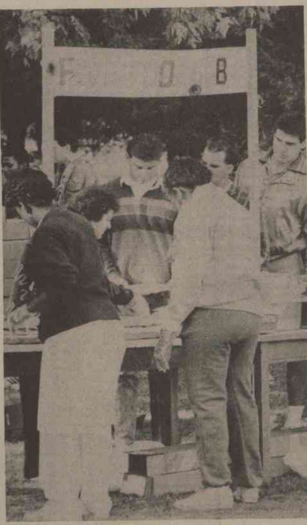
Five Foot Sub