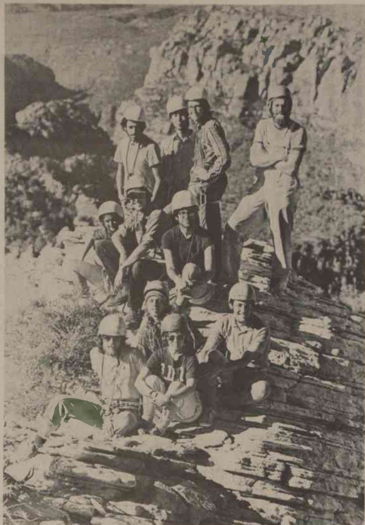
Outward Bound students relax after rock climb.

ON-CAMPUS TRAVEL representative or organization needed to promote Spring Break trip to Florida. Earn money, free trips and valuable work experience. Call Inter-Campus Programs: 1-800-433-7747.