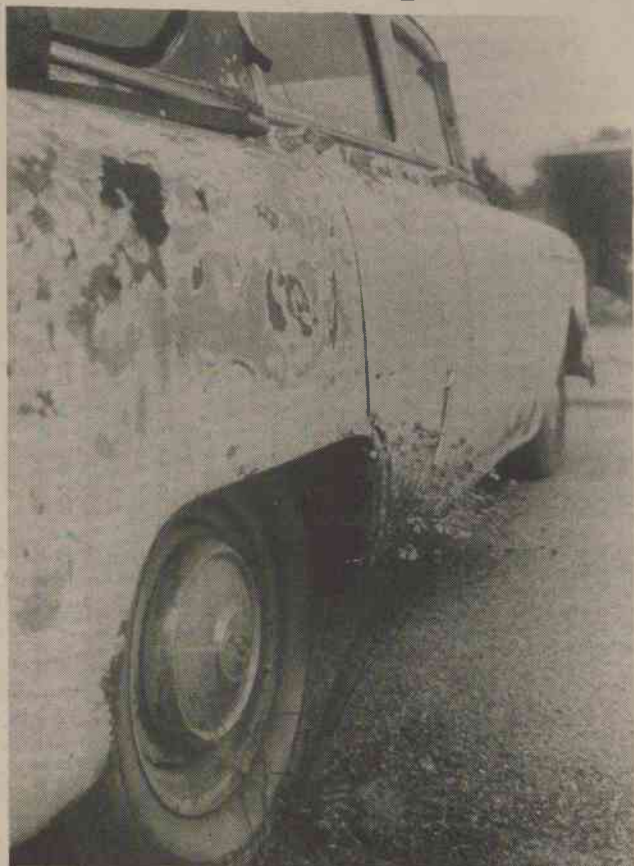
Bailey's "eye" comments on the tension between machine and Nature, pushing the body to its limits, and the fascination of molding something from nothing.