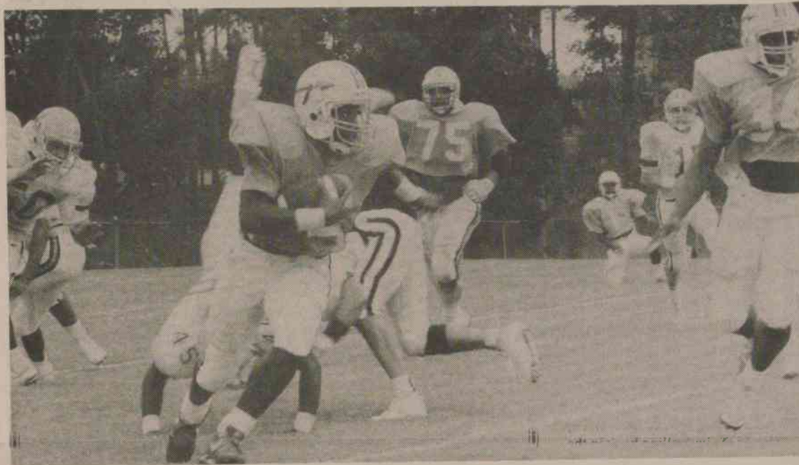
Heading down the field, as the Braves make an offensive comeback.