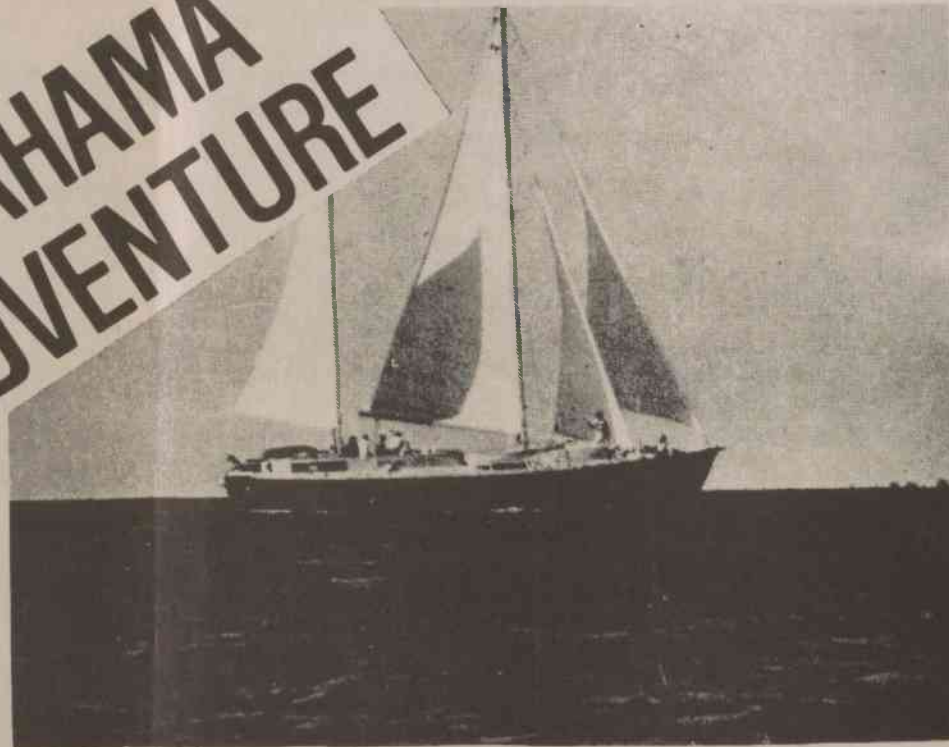
67' Ketch "Shark"