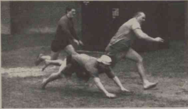
You can't catch me, I'm the Gingerbread man!