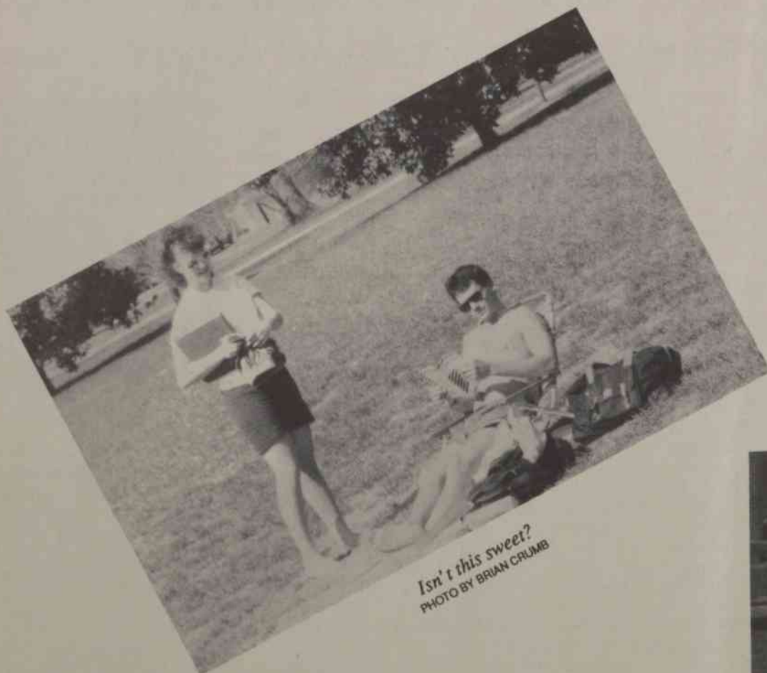
Isn't this sweeter?