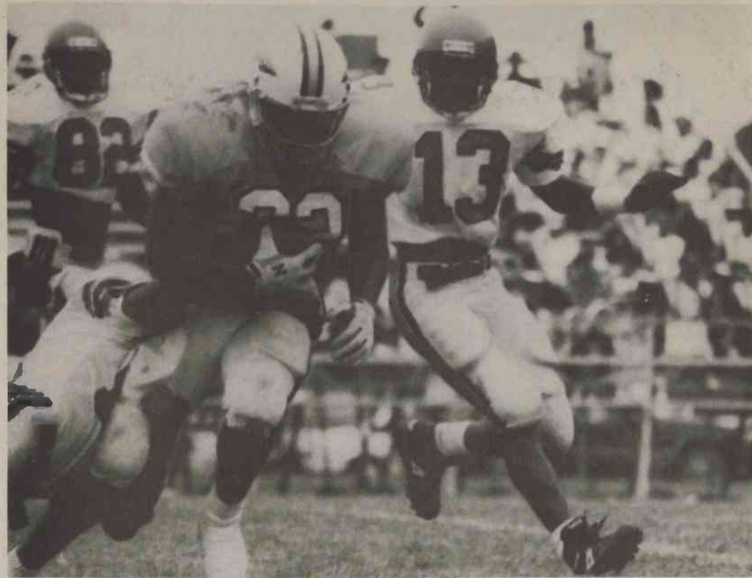
The Braves held on to win the homecoming game against Georgia Military in the final few seconds.