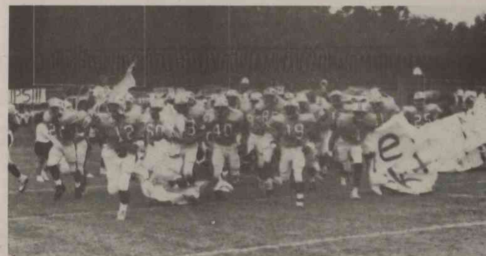
Look out . . . Here we come!