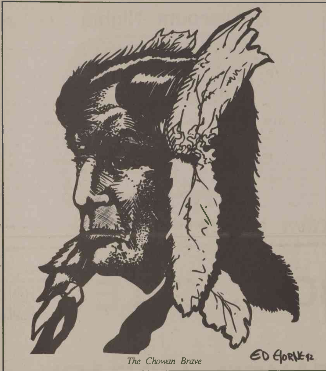
The Chowan Brave